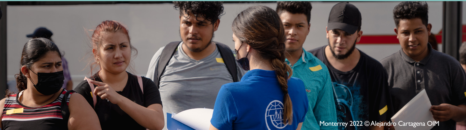
Monterrey 2022